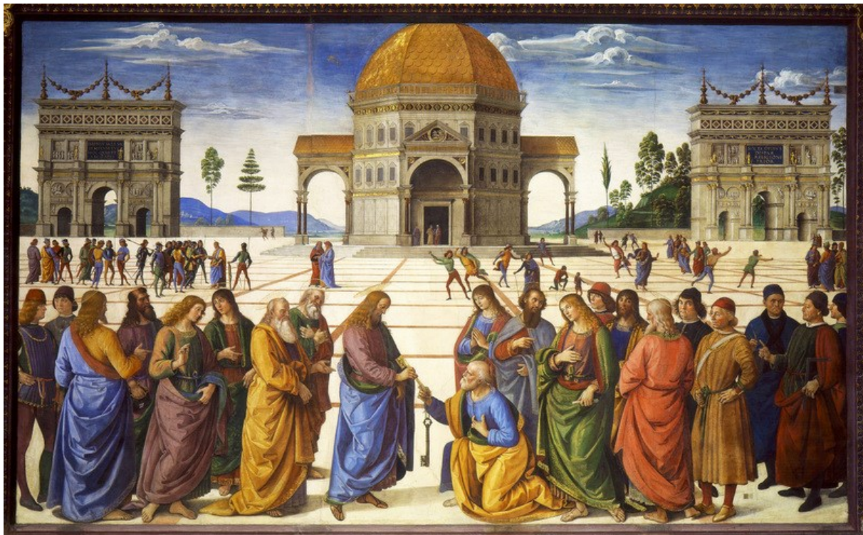
Delivery of the Keys Fresco, ca. 1481-1482 Pietro Perugino (1450-1523)

Jesus said, "You are Peter, and upon this rock I will build my church, and the gates of the netherworld will not prevail against it. I will give you the keys to the kingdom of heaven." (Mt 16:18-19)