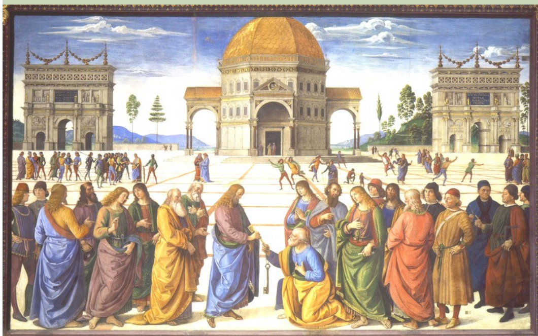
The Delivery of the Keys, ca. 1481-1482 Pietro Perugino (1450-1523)

Jesus said, "You are Peter, and upon this rock I will build my church, and the gates of the netherworld will not prevail against it. I will give you the keys to the kingdom of heaven." (Mt 16:18-19)