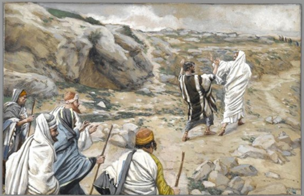
"Get Thee Behind Me, Satan!" Watercolor, 1886 James Tissot, 1836-1902

Then Jesus said to His disciples, "Whoever wishes to come after me must deny himself, take up his cross, and follow me. For whoever wishes to save his life will lose it, but whoever loses his life for my sake will find it."