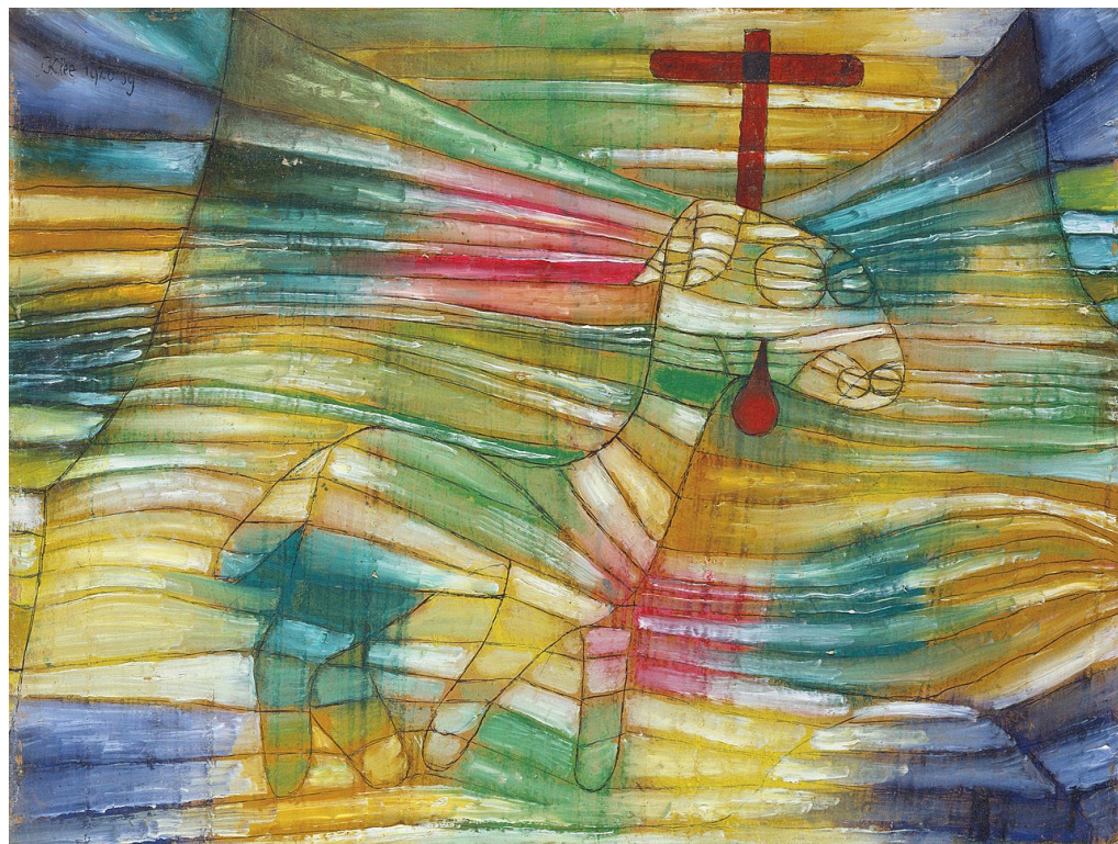
The Lamb, 1920 Paul Klee, 1879-1940

The lamb in this modern abstract piece walks through a multicolored canvas with a cross above his head, and a single drop of blood from his cheek. The gorgeous plethora of oil colors in this painting reflect the beauty in the gift of forgiveness.